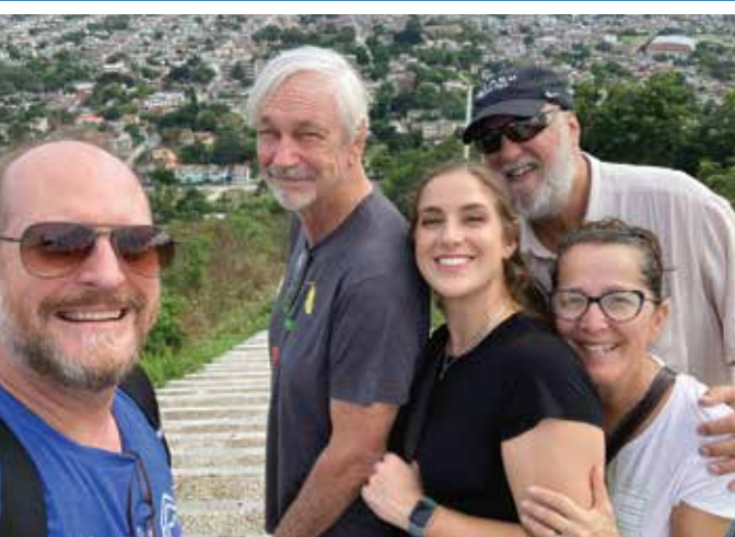
St. Luke's Global Missions team visits a mountain overlooking Holguín during their 2024 trip to reconnect with Melones Methodist Church and celebrate the opening of its new sanctuary.

"We thank God for the new church, which also serves the community in times of need. We're grateful for St. Luke's love and unconditional support."