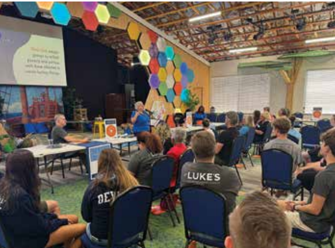
Participants of all ages engage in the Cost of Poverty Experience, gaining deeper understanding and empathy for those living in poverty.