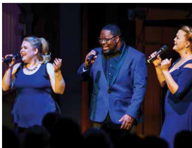
Soloists perform during the HymnSong concert, honoring the beauty and legacy of hymns.

"(HymnSong) sparked a desire for me to continue to share my gift and find an outlet that allows me to spread the good news and love of Christ."