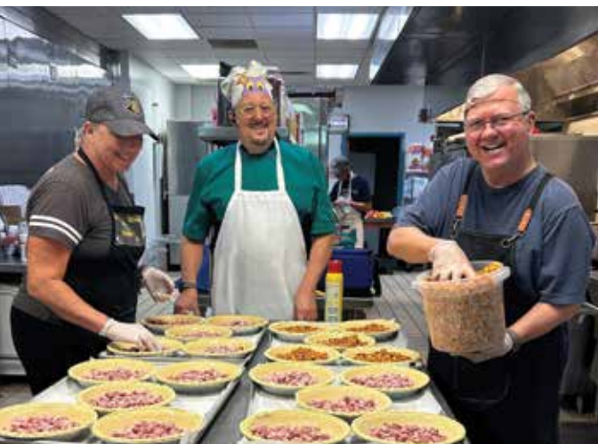
For more than 37 years, St. Luke's has partnered with the Coalition for the Homeless to prepare and serve monthly meals.

"Do not forget to do good to others. And share with them what you have. These are the sacrifices that please God."