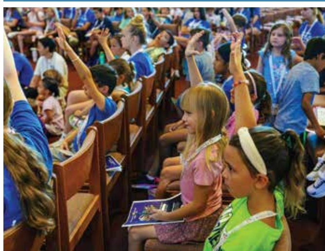
Kids engage with joy and curiosity during morning time at St. Luke's Vacation Bible School.