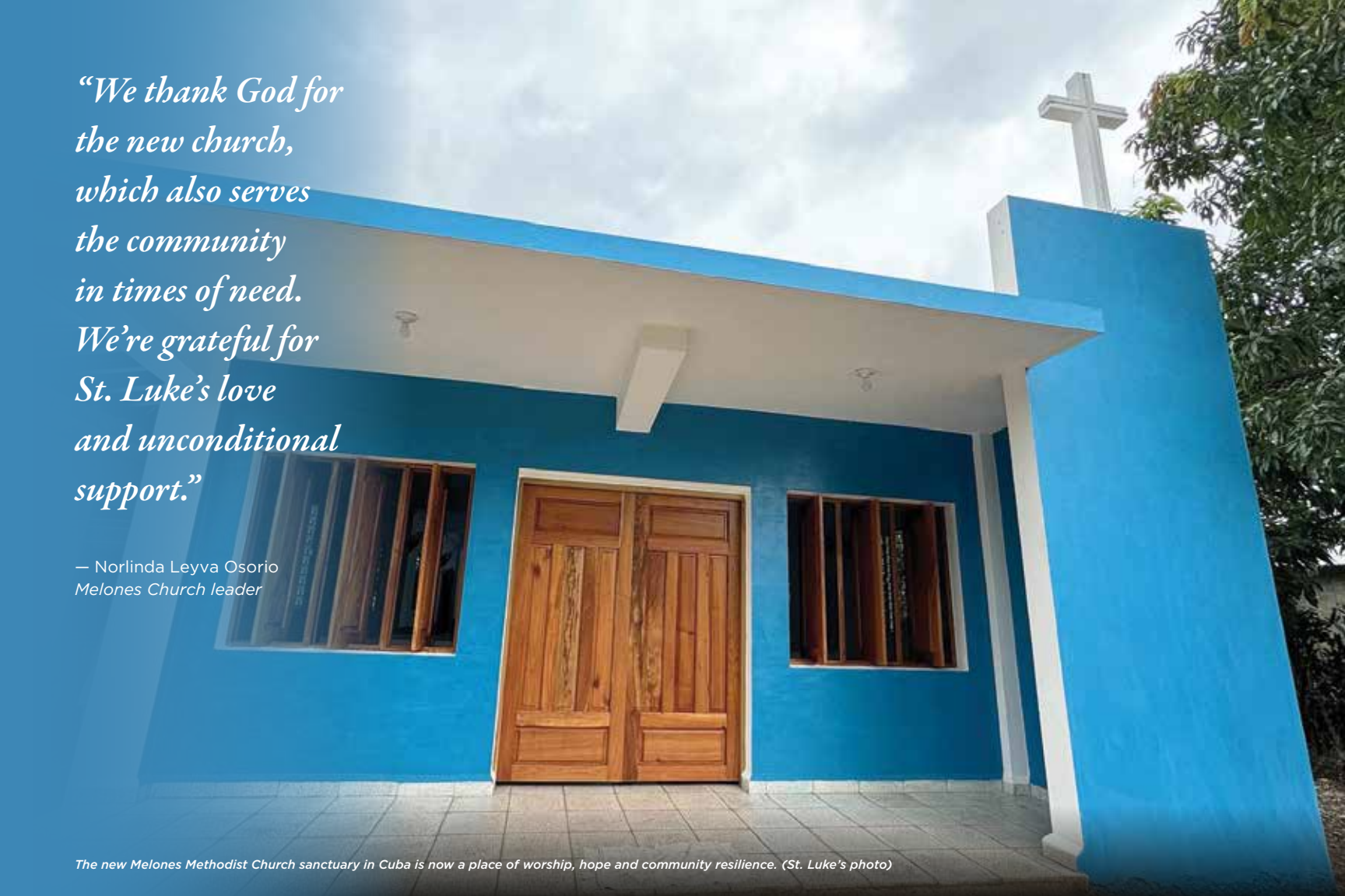
The new Melones Methodist Church sanctuary in Cuba is now a place of worship, hope and community resilience.