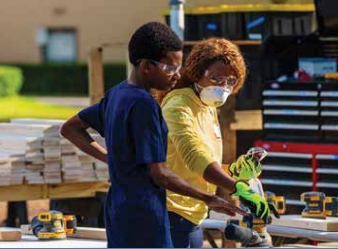
St. Luke's partners with Sleep in Heavenly Peace to build and deliver beds for children in need.