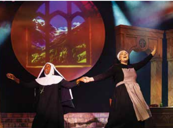
St. Lukers and community members come together to experience "The Sound of Music," a production of St. Luke's Theatre Ministry.